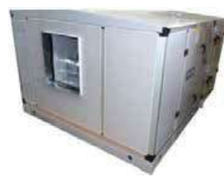
3AHB HEAVY DUTY