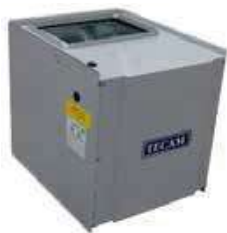
4FSM DIRECT COUPLING