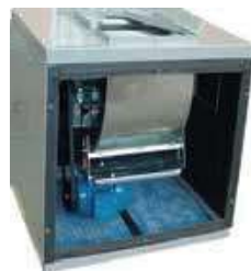
4FSM BAND TRANSMISSION