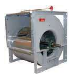
4FF WITHOUT CABINET